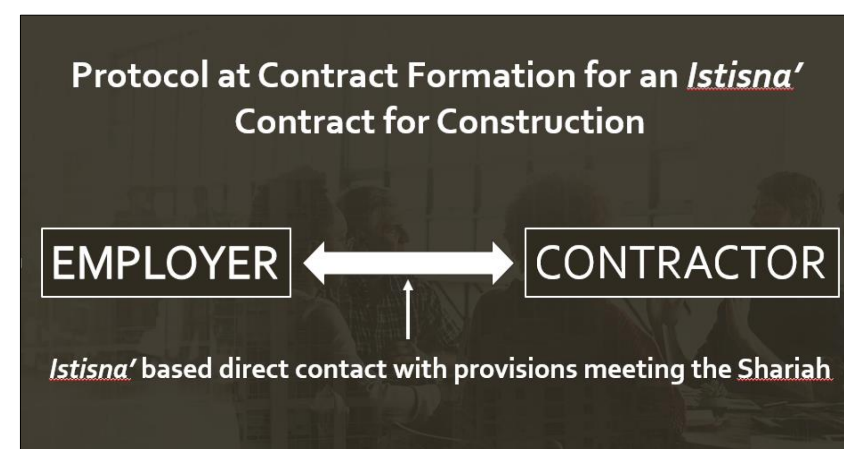
Diagram 1. Parties to an Istisna' contract for construction works

The product is in the form of a protocol for an Istisna' based Shariah compliance contract for construction works. The protocol is intended for Employers and Contractors wishing to have their contract performed in accordance with the Shariah. The protocol comprises of the following: 1. A conceptual model of an Istisna' based direct contract for construction works between the Employer and the Contractor. Refer to Diagram 1. 2. A set of 5 (five) documents and their pre-requisites for the purpose of forming a valid Istisna' based contract. Refer to Diagram 2 for the list of documents and the pre-requisites.