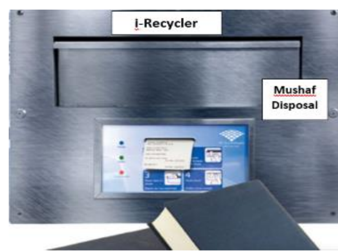
Figure 1: i-Recycler App System using "book chute" technique